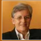
MS MARYAN STREET